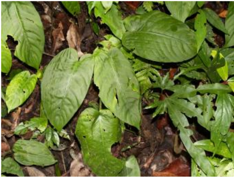
Figure 29. Schismatoglottis viridissima A.Hay with the diagnostic brilliant green, rubber leaves.