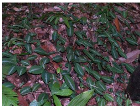
Figure 28. Schismatoglottis motleyana (Schott) Engl., a single clone forming a uniform colony.

The Rayu Trail leaves the Summit Trail at c. 275 m (c. 900 ft) and descends steeply into an open forested valley. The forest for the first part of the trail is rather dry and initially not too promising for aroids although the lianes Rhaphidophora tenuis and Scindapsus longispitatus are common and there are scattered plants of the truly monumental S. glaucescens with the shoot tips a mass of tough chaffy fibres and the backs of the leaves chalky white. Another common species climbing on trees on these dryish slopes is the ubiquitous Amydrium medium (Zoll. & Moritz) Nicolson (Plates 26 & 27), a low-climbing species with leaves that while entire in juveniles become split and perforated in adult plants. Amydrium medium is unusual among climbing aroids in that it