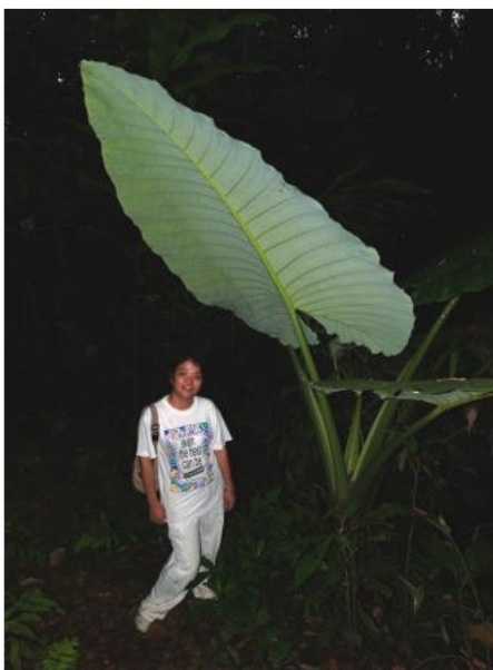
Figure 40. Alocasia robusta M.Hotta, the largest Alocasia species yet described. Leaves can reach more up to 6 m (nearly 20 ft) long including the petioles and nearly 3 m (more than 9 ft) wide across the lamina.

several characters readily separate them, including the leaves (oblong and thick-textured with veins not at all prominent: A. nitidum vs. elliptic and thin-textured with veins deeply impressed: A. simplex ) and the inflorescence (spathe persisting and eventually turning pale green and eventually pushed off by developing fruits: nitidum vs. spathe caducous (shedding fresh) early in