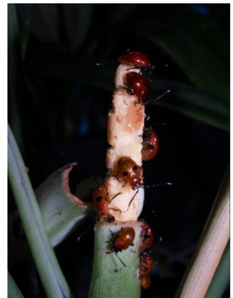
Figure 33. Schismatoglottis jipomii P.C.Boyce & S.Y.Wong, just before male anthesis; the appendix here much predated by Chrysomelid beetles.

The Waterfall Trail is the richest of the set trails for seeing aroids and by virtue of much activity by our student projects on pollination biology, also one of the best sampled and understood. The Waterfall Trail begins c. 1 km along the Summit Trail and initially ascends through a short stretch of ridge top kerangas accessed by a wooden boardwalk. The first part of the kerangas is a small, open and permanently saturated area providing a fascinating patch of plants adapted to the very nutrient-deficient white sands; aside from three terrestrial Utricularia (bladderwort) species with dainty wiry stems topped with yellow, white or purple long-spurred flowers, a selection of species from the monocot families Xyridaceae, Burmanniaceae, Cyperaceae, Eriocaulaceae and Centrolepidaceae, provide a good introduction to these diminutive but fascinating 'grass-like' plants. The path descends steeply via wooden steps into valley dipterocarp forest and immediately the aroids begin to become abundant. The trees carry numerous plants of Scindapsus longistipitatus and the ground is also clothed with the juvenile phase of this and scattered plants of S. pictus Hassk. By peering into the canopy, large fans or rosettes of perching aroids are visible – these are S. beccarii Engl. and S. genuculatus Engl. ( Plate 34 ), unusual among Asian aroids in being true