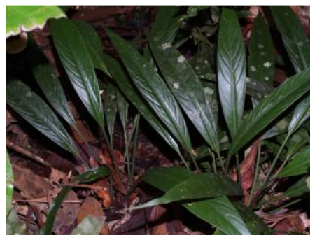
Figure 32. Schismatoglottis jipomii P.C.Boyce & S.Y.Wong forms dense clumps of narrow leathery leaves; a common species along rivers in western Sarawak but only formally named in 2006.