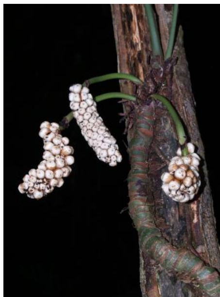
Figure 27. Amydrium medium (Zoll. & Moritz) Nicolson produces distinctive white berries.

The Rayu Trail is the longest single trail at Kubah, extending nearly 9 km (5 ½ miles) from the NE boundary of the park to the