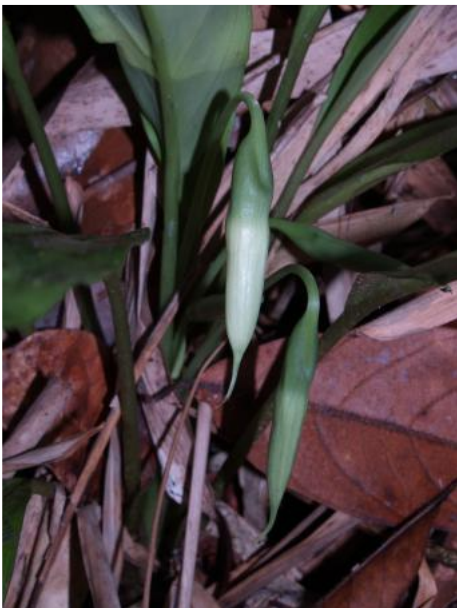
Figure 31. Schismatoglottis longifolia Ridl. with groups of wiry-stemmed nodding inflorescences quite unlike any other Schismatoglottis .