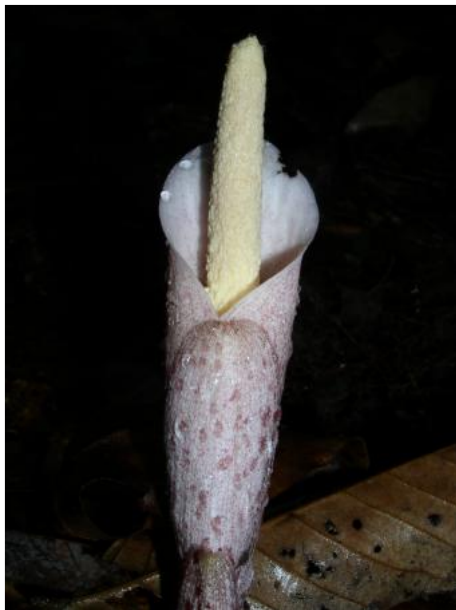
Figure 36. Amorphophallus infundibuliformis Hett., A.Dearden & A.Vogel, a common and widespread species in deep wet forest.

epiphytes. At first, seemingly the same species, they can be distinguished by differences in the leaf shape and plant habit. Scindapsus geniculatus has the leaf blades narrowing to a pointed tip, the upper surfaces matte pale green and the undersurfaces distinctly glaucous, whereas S. beccarii has leaf blades with tips that are blunt and with an abrupt apiculate point and the upper surfaces rich glossy green. In habit, the plants differ in that S. geniculatus remains a dense fan throughout its life, whereas S. beccarii has alternating periods of producing