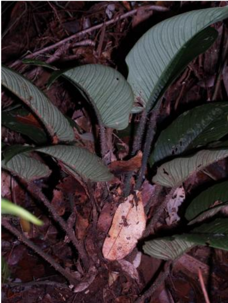
Figure 30. Schismatoglottis ciliata A.Hay, the stiff erect leaves function as litter traps. Note the white-hairy petioles.