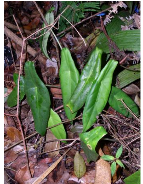
Figure 25. Alocasia peltata M.Hotta is related to A. beccarii but differs in several morphologies and in being restricted to much higher altitudes.