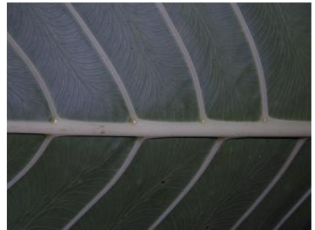
Figure 41. Alocasia sarawkensis M.Hotta, another large species easily distinguished by the prominently raised abaxial veins. Note, too, the waxy glands at the axis of the primary lateral veins to the midrib.

From the end of the boardwalk extends a smooth granite platform over which the river falls in a series of waterfalls and pools leading upstream to a steep sandstone waterfall dominated by huge stands of S. multiflora and Piptospatha grabowskii interspersed with Aridrum borneense in the waterflow and, on the cliffs away from flooding, curtains of S. mayoana . Other notable plants along the bases of the rocky banks are Alocasia scabriuscula and the rheophytic Rhapsidophora beccarii Engl. ( Plate 42 ), with leaves at first narrow and entire and later wider and deeply and broadly divided along with small areas of Homalomena paucinervia .