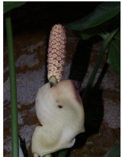
Figure 26. Amydrium medium (Zoll. & Moritz) Nicolson is unusual among aroid lianes in flowering low on the tree trunk on which it climbs.