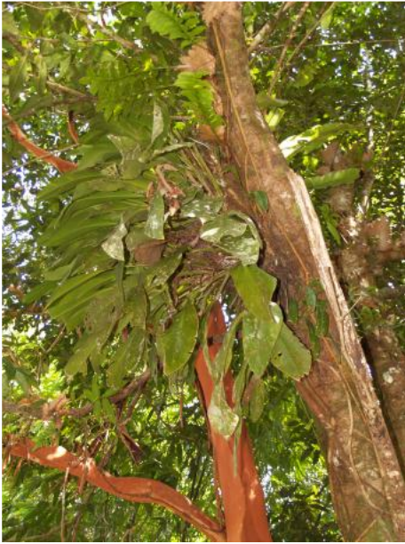
Figure 34. Scindapsus geniculatus Engl., a very old plant on the main branches of a riverside Tristaniopsis (Myrtaceae).