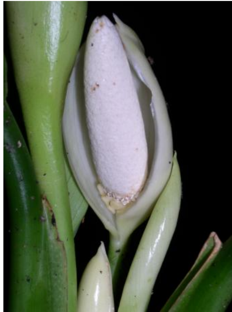
Figure 38. Aglaonema nitidum (Hack) Kunth with the spathe persistent.

anthesis: simplex ). About the mid-point the trail crosses a series of small forest streams with the rocks covered with Homalomena paucinervia and a few scattered plants of Piptospatha grabowskii and Schismatoglottis multiflora and then passes through a more open, deep but narrow valley dominated by large stands of Alocasia robusta M.Hotta ( Plate 40 ). Further along a suspended boardwalk passes through an area of swamp forest dominated by very spiny palms of the genera Salacca and Elaeodora and fringed with Alocasia sarawkensis M.Hotta, with its very distinctive raised veins on the back of the leaf lamina ( Plate 41 ). From this point the trail gradually climbs over a series of rocky, alluvium-covered ledges and then follows a stepped boardwalk along a granite and sandstone cliff above the Sungai Rayu; the cliff has numerous plants of Homalomena insignis , H. borneensis (or perhaps H. hostiifolia ) and scattered H. crassinervia , Schismatoglottis wallichii and S. nervosa .