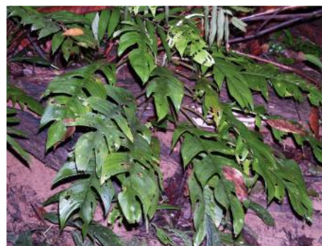
Figure 42. Rhapsidophora beccarii Engl., a common rheophytic species allied to R. korthalsii .

anthesis: simplex ). About the mid-point the trail crosses a series of small forest streams with the rocks covered with Homalomena paucinervia and a few scattered plants of Piptospatha grabowskii and Schismatoglottis multiflora and then passes through a more open, deep but narrow valley dominated by large stands of Alocasia robusta M.Hotta ( Plate 40 ). Further along a suspended boardwalk passes through an area of swamp forest dominated by very spiny palms of the genera Salacca and Elaeodora and fringed with Alocasia sarawkensis M.Hotta, with its very distinctive raised veins on the back of the leaf lamina ( Plate 41 ). From this point the trail gradually climbs over a series of rocky, alluvium-covered ledges and then follows a stepped boardwalk along a granite and sandstone cliff above the Sungai Rayu; the cliff has numerous plants of Homalomena insignis , H. borneensis (or perhaps H. hostiifolia ) and scattered H. crassinervia , Schismatoglottis wallichii and S. nervosa .