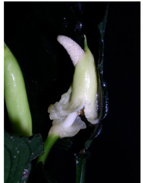
Figure 39. Aglaonema simplex (Blume) Blume at the onset of male anthesis with the spathe already partially shed.