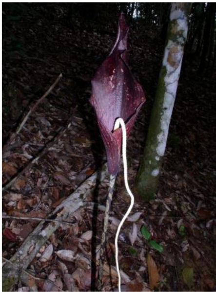
Figure 37. Amorphophallus pendulus Bogner & Mayo described more than 20 years ago and yet still unrivaled as one of the most extraordinary species. Endemic to dry dipterocarp forest in west Sarawak.

several characters readily separate them, including the leaves (oblong and thick-textured with veins not at all prominent: A. nitidum vs. elliptic and thin-textured with veins deeply impressed: A. simplex ) and the inflorescence (spathe persisting and eventually turning pale green and eventually pushed off by developing fruits: nitidum vs. spathe caducous (shedding fresh) early in