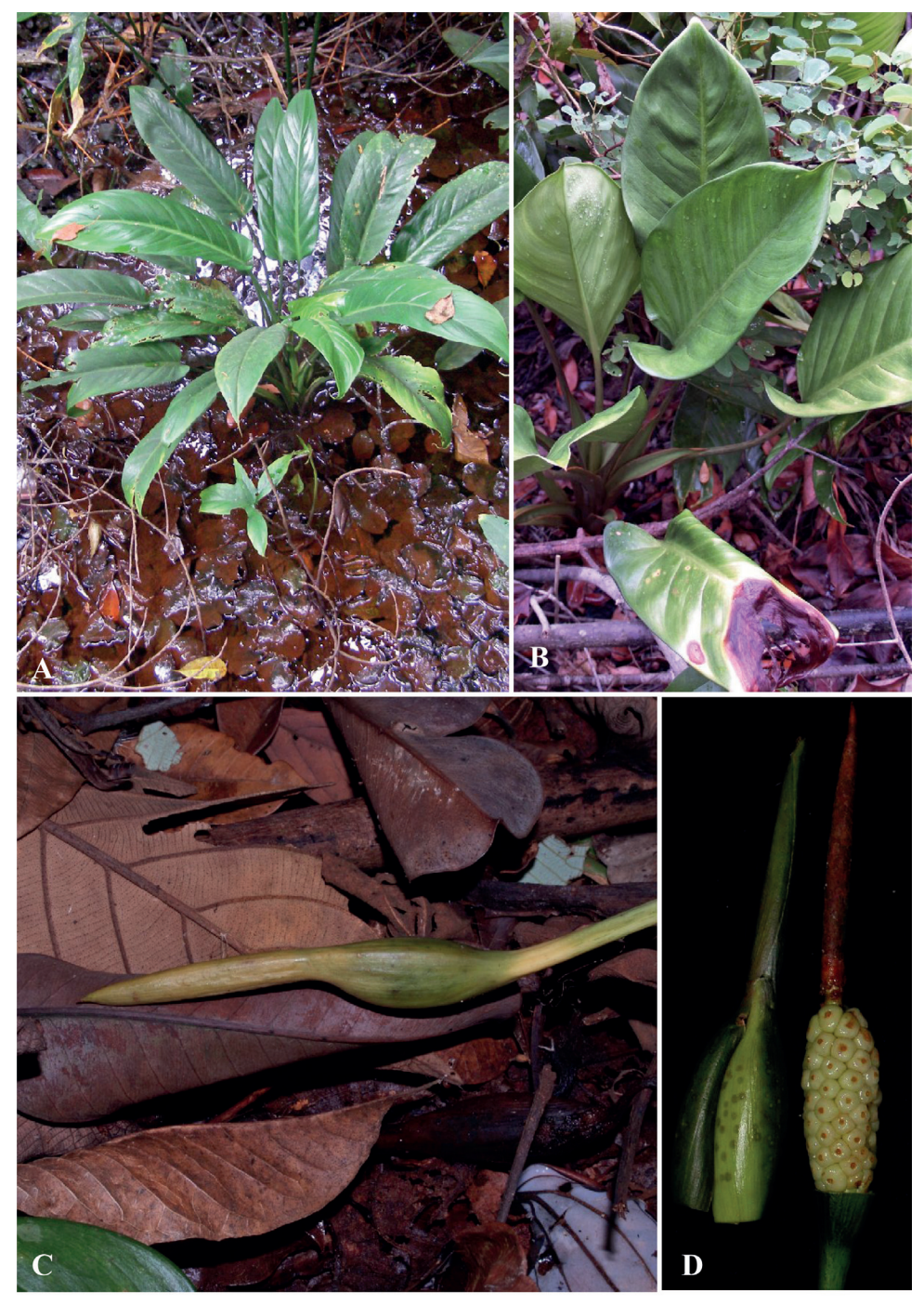
Fig. 3. Homalomena rostrata Griff. A & B. Plants in habitat showing variation in leaf lamina shape. C. Sub-mature infructescence. D. Mature infructescence with spathe artificially removed. Note the glands on the lower spathe exterior. Images: A : AR-1416 ; B : AR-1372 ; C : AR-2600 ; Photo credits: P.C. Boyce. D : S. Lee 319 . Courtesy of Singapore Botanic Gardens, used with permission.