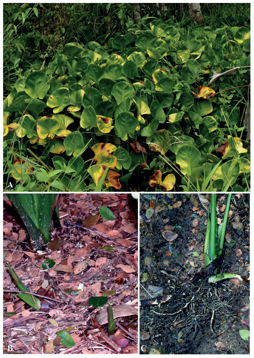
Fig. 1. Homalomena expedita A.Hay & Hersc. A. Plants in habitat at type locality, Batang Kayan. B. Detail of emerging shoots on margins of colony. C. Active leafy shoot with precursor stolon (to left of shoot) and developing new rhizome (to right).