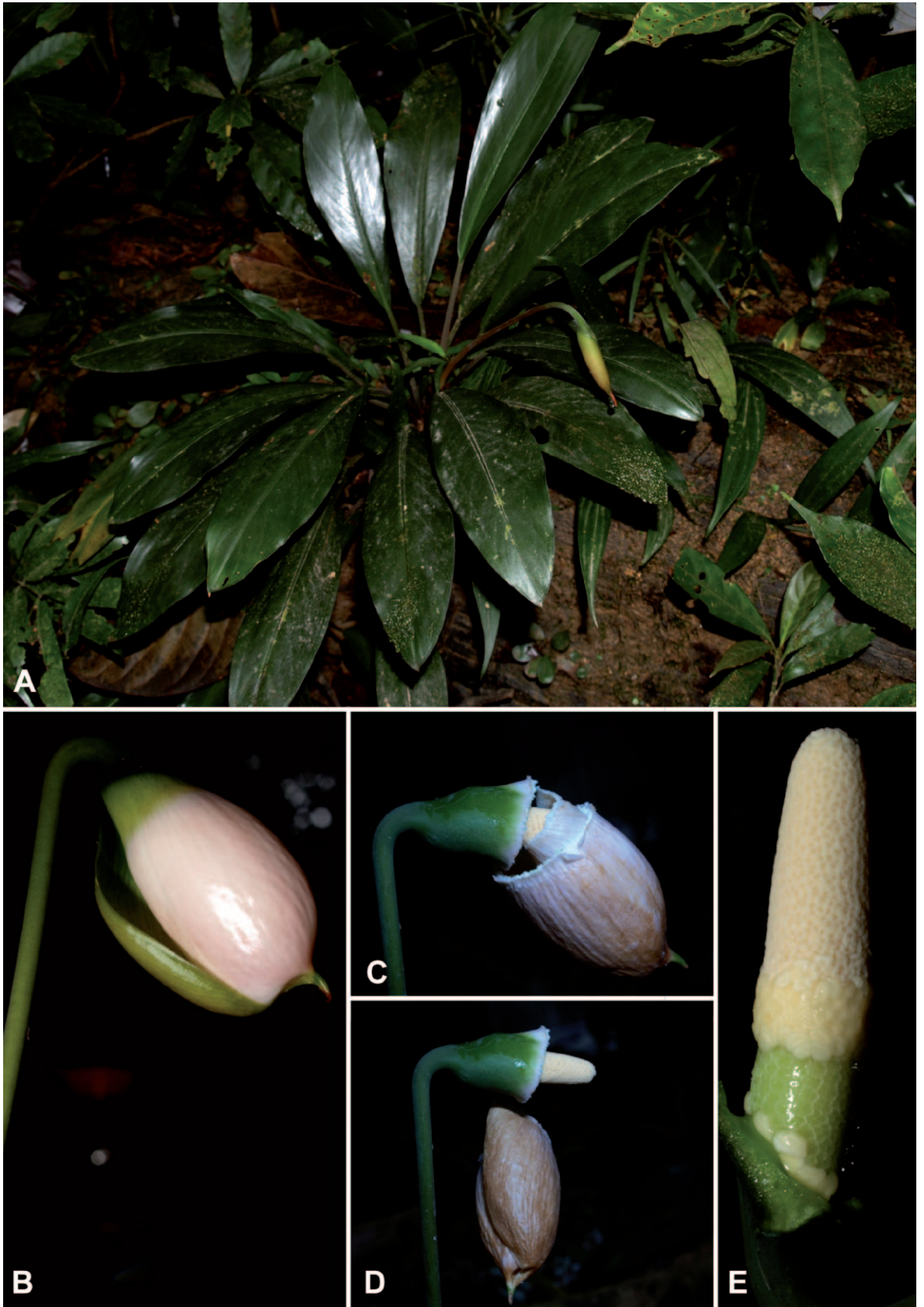
Fig. 2. Piptospatha burbidgei – A: flowering plant in habitat, on shales, Mulu N. P., N. Sarawak; B: inflorescence at pistillate anthesis; C: inflorescence at onset of staminate anthesis. Note that the spathe limb has begun to senesce and has partly separated from the lower, persistent spathe; D: inflorescence towards end of staminate anthesis; E: spadix (spathe artificially removed) at pistillate anthesis. – Photographs from P. C. Boyce & al. AR-1973 by P. C. Boyce.