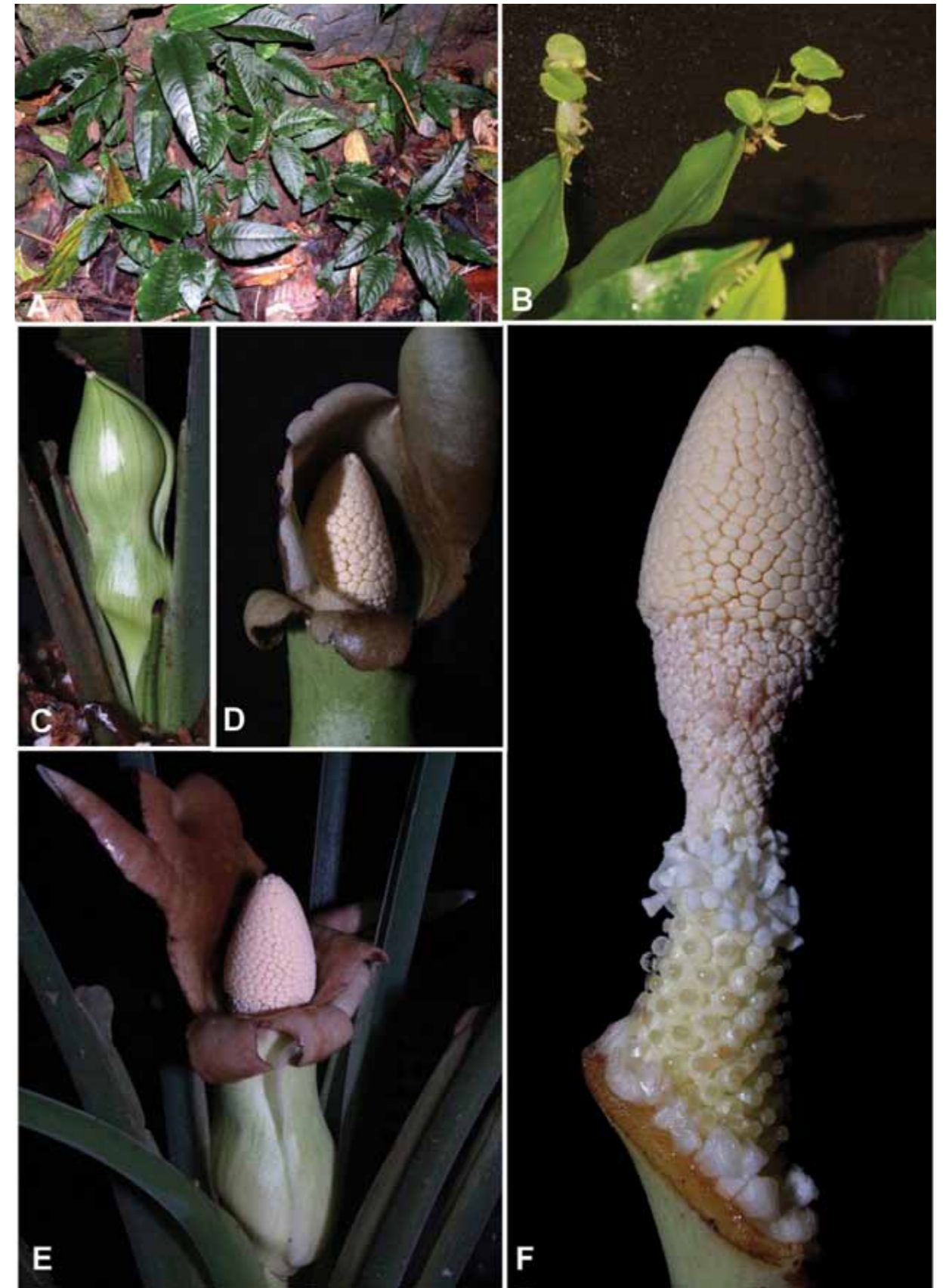
Fig. 2. Schismatoglottis hayi S.Y.Wong & P.C.Boyce. A, plants in habitat; B, adventitious plantlets on the tip of the leaf blade; C, inflorescence just prior to anthesis; D, inflorescence at onset of pistillate anthesis (note that the spathe limb had opened, darkened, and begun to split); E, inflorescence at male anthesis (the spathe is beginning to deliquesce and turn glossy, note the clearly visible pubescent petioles); F, spadix at staminate anthesis with the spathe artificially removed (note that the interstice staminodes are long and have flat tops, the distal part of the staminate zone is narrower than the base of the appendix, and that the appendix is pointed). A–F from AR-1880.