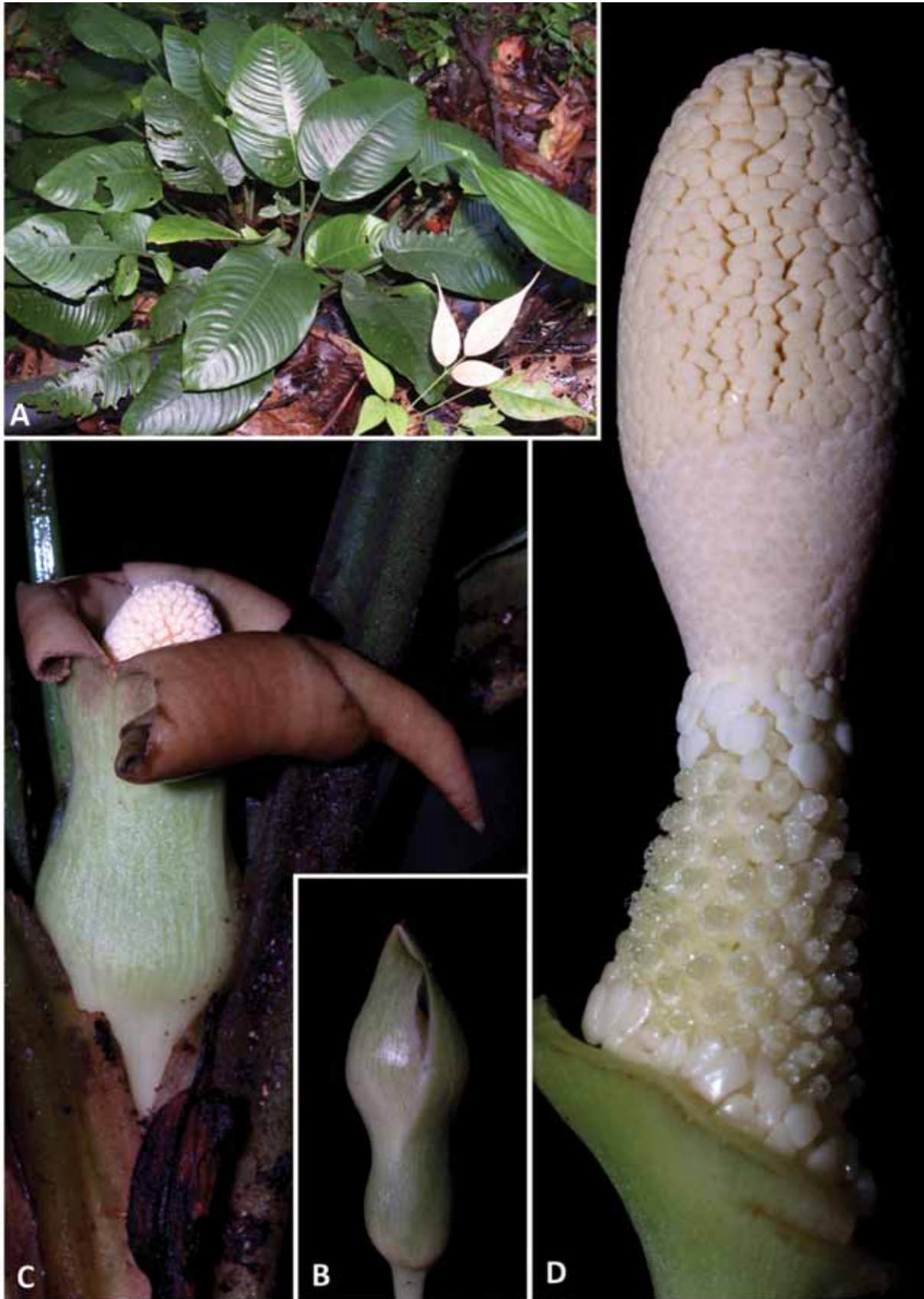
Fig. 3. Schismatoglottis multinervia M.Hotta. A , plants in habitat; B , inflorescence at onset pistillate anthesis (note the small gap that is created by the expansion of the spathe limb); C , inflorescence at onset of staminate anthesis, the spathe limb has expanded and split longitudinally, at the same time darkening, and the pubescent petiole is clearly visible; D , spadix at pistillate anthesis with the spathe artificially removed (note that the interstice staminodes are short and have rounded tops, the distal part of the staminate zone is the same diameter at the base of the appendix, and the appendix is blunt). A–D from AR-1932.