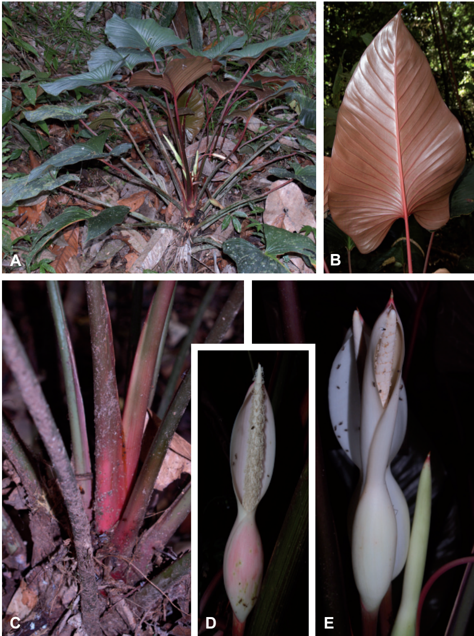
Plate 1. Homalomena ardua P.C.Boyce & S.Y.Wong. A. Overall plant; B. Abaxial leaf lamina dark red with equally coloured midrib; C. Red petiole bases; D. Inflorescence shedding pollen at male anthesis; E. Inflorescences with emerging inflorescence bud; note the sequential emergence. The inflorescence at the back is at female anthesis; that next is at male anthesis.