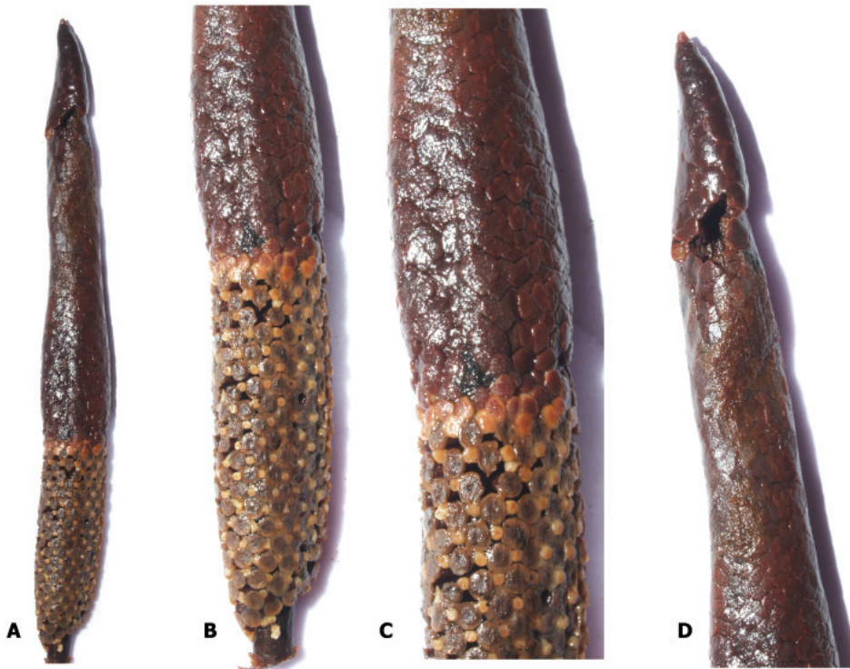
Plate 4. Homalomena josefii P.C.Boyce & S.Y.Wong. A. Whole spadix, spathe removed, from alcohol collection; B. Close up of female/male zone transition; C. Detail of female zone, note evenly sized female flowers; D. Male zone and spadix tip; note the vestigial naked appendix at the tip.

brown, petiolar sheath ca 16-21 cm long, ca \frac{1}{4} to \frac{1}{3} of petiole length, equal, sometimes unequal, broader side rounded at apex, narrower side, weakly decurrent at apex, margin always convolute when fresh, sometimes wide open with broader petiolar sheath, sheath initially long-persistent with the marginal 1.5 mm, soon drying paler, eventually the whole sheath marcescent; lamina broadly ovato-sagittate, 25-45 cm long x 18-32 cm wide, thinly leathery, glossy dark to pale green adaxially (fresh), drying pale olive green, abaxially matte green (fresh), drying pale brown, base cordate, posterior lobes spreading, subtriangular 7-9 cm long, lamina tip obtuse, short-acuminate for ca 1 cm, thence, stiffly apiculate for ca 2-7 mm; midrib raised abaxially (fresh and dry), green when fresh, drying reddish brown, adaxially flush with lamina, ca 1.5 mm wide, with 6-9 primary lateral veins on each side, diverging at 50^{\circ} - 90^{\circ} from the midrib, adaxially impressed (fresh), flush with lamina when dry, abaxially slightly raised (fresh and