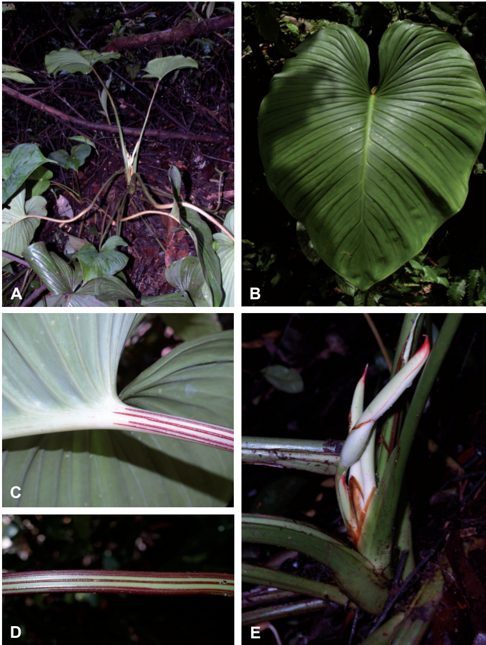
Plate 7. Homalomena striatiepetiolata P.C.Boyce & S.Y.Wong: A. Overall plant with decumbent petioles; B. Leaf lamina glossy green; C. Abaxial leaf lamina pale green with striate-raised ridges on petiole; D. Striking striate-raised ridges on petiole; E. Synflorescence with spathe mucro and margin stained striking cherry red, note the marcescent prophyll.