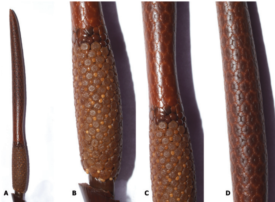
Plate 8. Homalomena striatieopetiolata P.C.Boyce & S.Y.Wong. A. Whole spadix, spathe removed, from alcohol collection; B. Close up of female/male zone transition; C. Detail of female zone; D. Male zone.

margin cherry red; lower spathe narrowly ellipsoid, ca 4.6 cm long, weakly constricted at the junction of the spathe limb, the constriction coinciding with the lower-most fertile male flowers, spathe limb narrowly lanceolate, ca 8.2 cm long, bluntly mucronate to ca 5 mm long. Spadix equalling the spathe, ca 12 cm long, shape, stipitate, stipe to ca 4.4 mm long, obliquely inserted on peduncle, obpyramidal, female zone ca 2.7 cm long x 9.5 mm wide, ca \frac{1}{4} length of spadix, weakly fusiform, female flowers densely arranged, ca 1.5 mm diam. x 1.3 mm tall, squat-cylindrical, stigma exceeding the ovary, coherent to adjacent stigma, umbonate and weakly tetrasulcate, interpistillar staminodes clavate, on a very slender stipe, remaining pale brown in alcohol, ca 0.5 mm wide x 1.1 mm long, slightly overtopping the female flowers, lower most female flowers ca twice the size of fertile females mostly associated with two or more interpistillar staminodes and seemingly sterile, suprapistillar pistillodes in three rows and merging with the lower most male flowers these seemingly sterile, male zone ca 8 cm long x 7.7 mm wide, ca \frac{2}{3} length of spadix, very weakly fusiform and