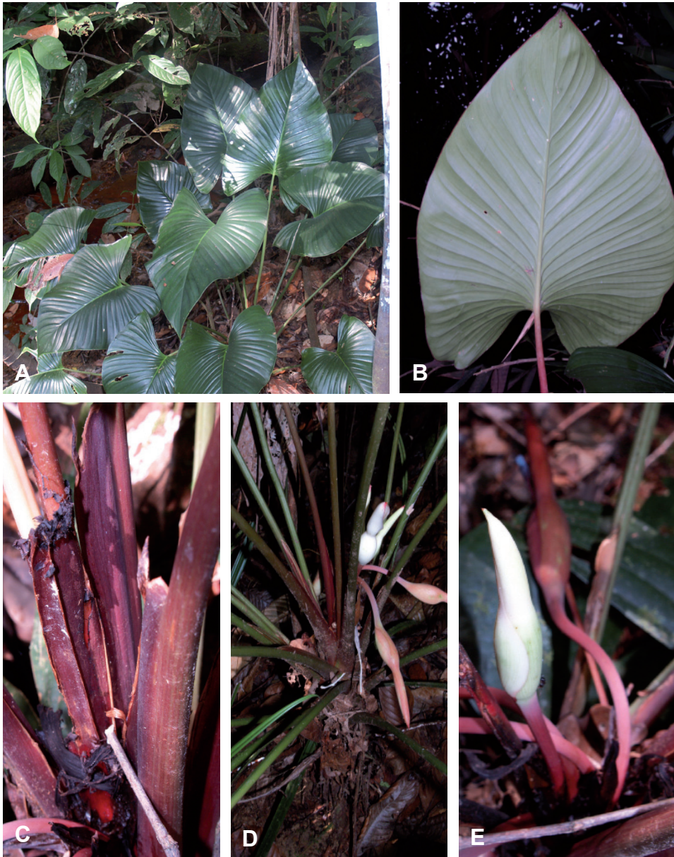
Plate 3. Homalomena josefii P.C.Boyce & S.Y.Wong. A. Overall plant; B. Abaxial leaf lamina pale green, with red petiole; C. Red petiole bases; D. Petioles in green form with inflorescences and infructescences; E. Emerging inflorescence bud with declinate infructescences.