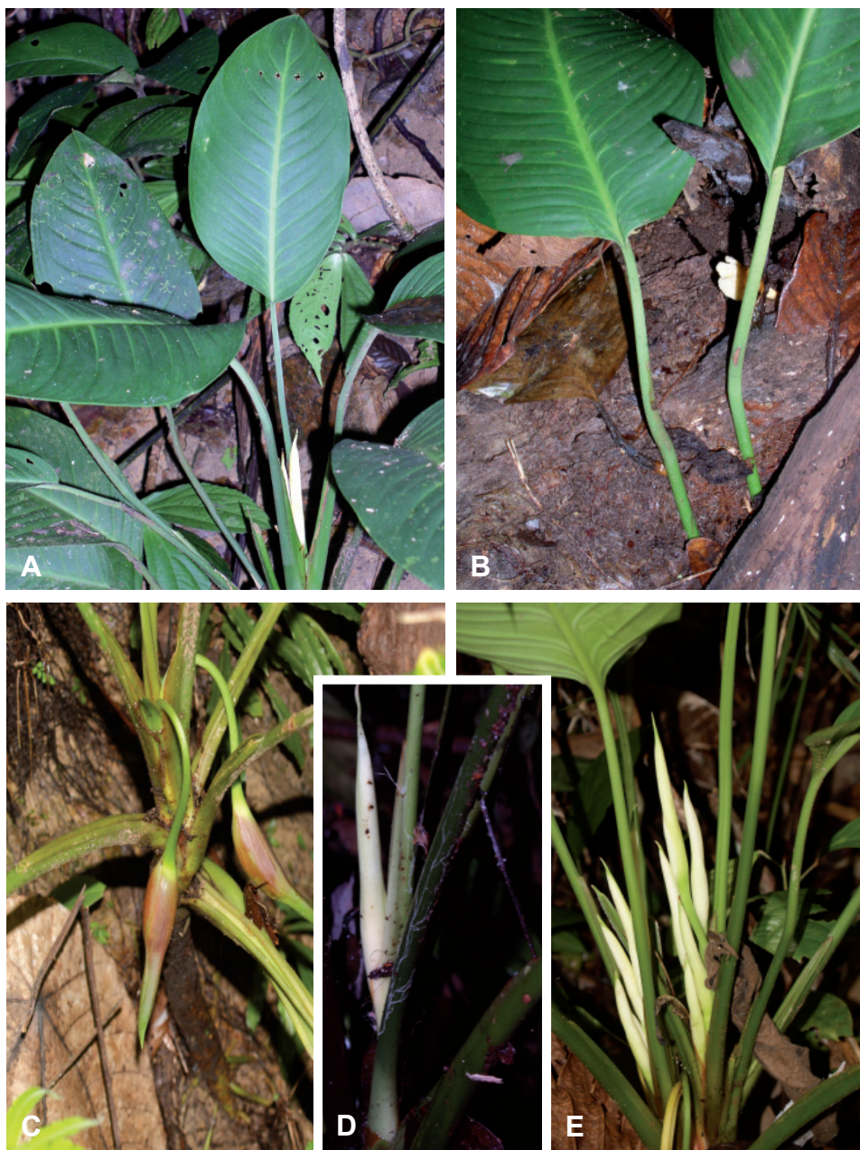
Plate 5. Homalomena pseudogeniculata P.C.Boyce & S.Y.Wong. A. Overall plant; B. Pulvinate petioles; C. Declinate infructescences; D. Emerging inflorescence with distinctive mucro; E. Two synflorescences.