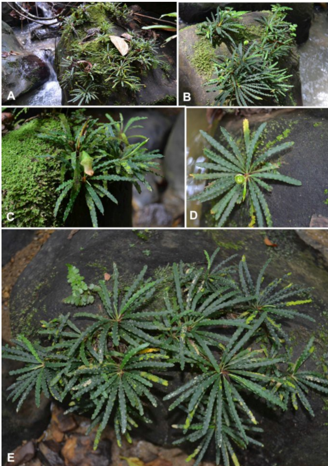
Figure 1. Fenestratarum mulaydii P. C. Boyce & S. Y. Wong. A–E. Plants in habitat, Type locality. A & E. General view of plants in habitat. B. Flowering plant. C. Post anthesis plant. D. Fruiting plant. A–E from AR-5000 .