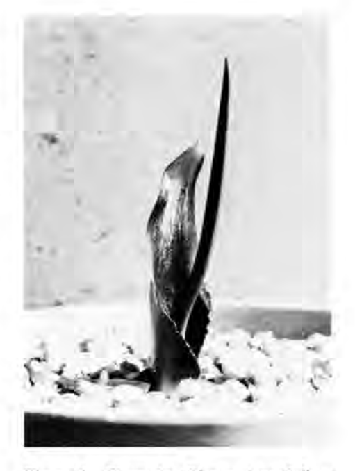
Figure 4: Flowering Biarum tenuifolium at Kew; note dressing of chips.

The fruits of Biarum are also noteworthy and illustrate a further important difference between this genus and Arum . The latter forms the well-known "Cuckoo Pint" fruiting head of bright scarlet glossy berries, borne on an erect stalk, and the seemingly sudden emergence of these colourful fruits after the apparent disappearance of the flow-