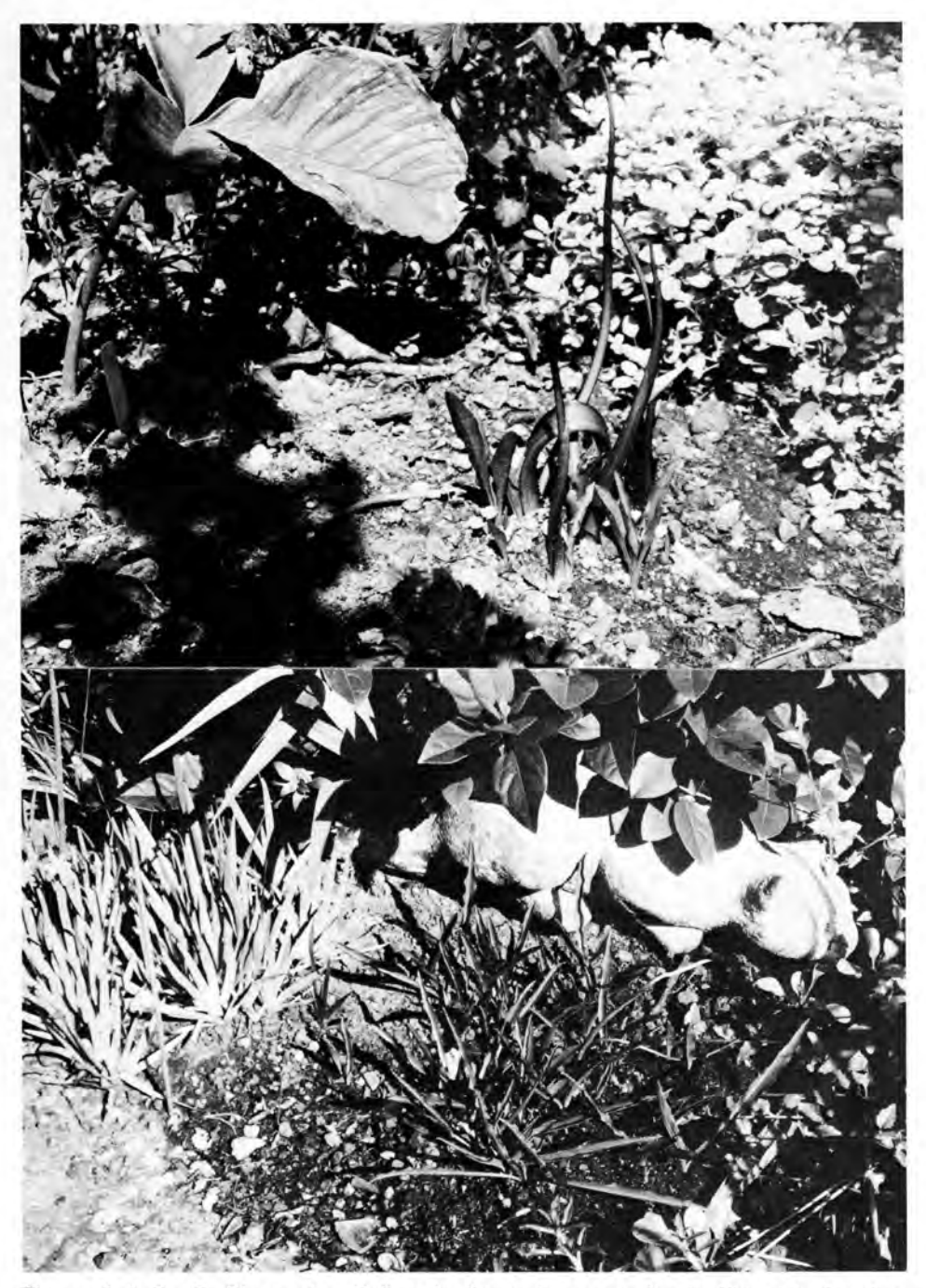
Figures 2 & 3: 2. Biarum tenuifolium in flower in our garden in Chiswick, London. Note Arisaema candidissimum leaves on the left. 3. Biarum tenuifolium foliage with Sisyrinchium brachypus on right. Our garden, Chiswick, London.