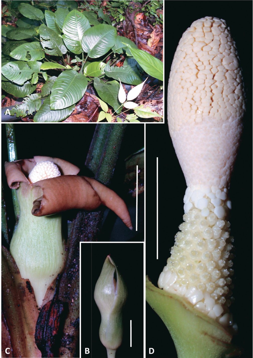
FIG. 1. Schismatoglottis multinervia M. Hotta. A: Plants in habitat. B: Inflorescence at onset pistillate anthesis; note the small gap that is created by the expansion of the spathe limb. C: Inflorescence at onset of staminate anthesis. The spathe limb has expanded and split longitudinally, at the same time darkening. The pubescent petiole is clearly visible. D: Spadix at pistillate anthesis with the spathe artificially removed. Note that the interstice staminodes are short and have rounded tops. Note too distal part of the staminate zone is the same diameter at the base of the appendix, and that the appendix is blunt. All from P. C. Boyce & al. AR-1932. Scale bar = 1 cm.