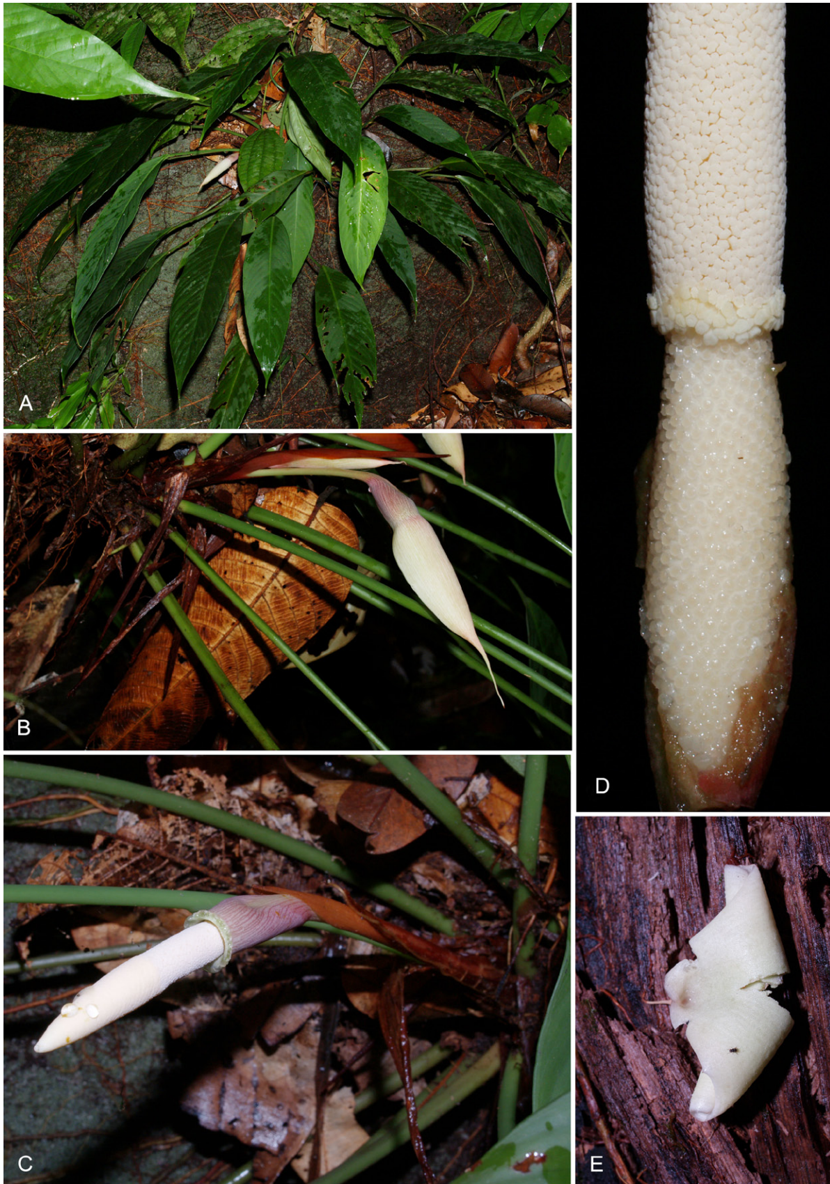
Fig. 3. Schismatoglottis nicolsonii – A: plants in habitat, edge of sandstone waterfall, Bako N. P.; B: flowering plant in habitat; C: inflorescence at onset of staminate anthesis, with spathe limb shed; D: detail of pistillate zone and lower part of staminate zone. Note that staminate zone is fertile to base; E: spathe limb shed during onset of staminate anthesis. – All from P. C. Boyce & al. AR-2106. – Photographs by Peter C. Boyce.