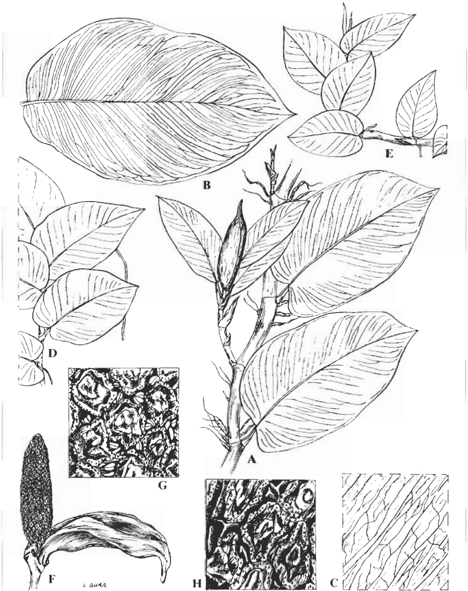
Figure 1. Rhaphidophora hayi P.C. Boyce & Bogner

A. adult shoot with flowering branch \times \frac{1}{3} ; B. leaf lamina \times + ; C. venation detail \times 3 ; D. pre-adult climbing shoot \times + ; E. disarticulating side shoot \times \frac{1}{3} ; F. inflorescence \times 1 ; G. spadix detail at female receptivity \times 10 ; H. spadix detail at post-anthesis \times 10 . A–C from Webb & Tracey 7066; D–H from Sands, Patison & Wood 2384.