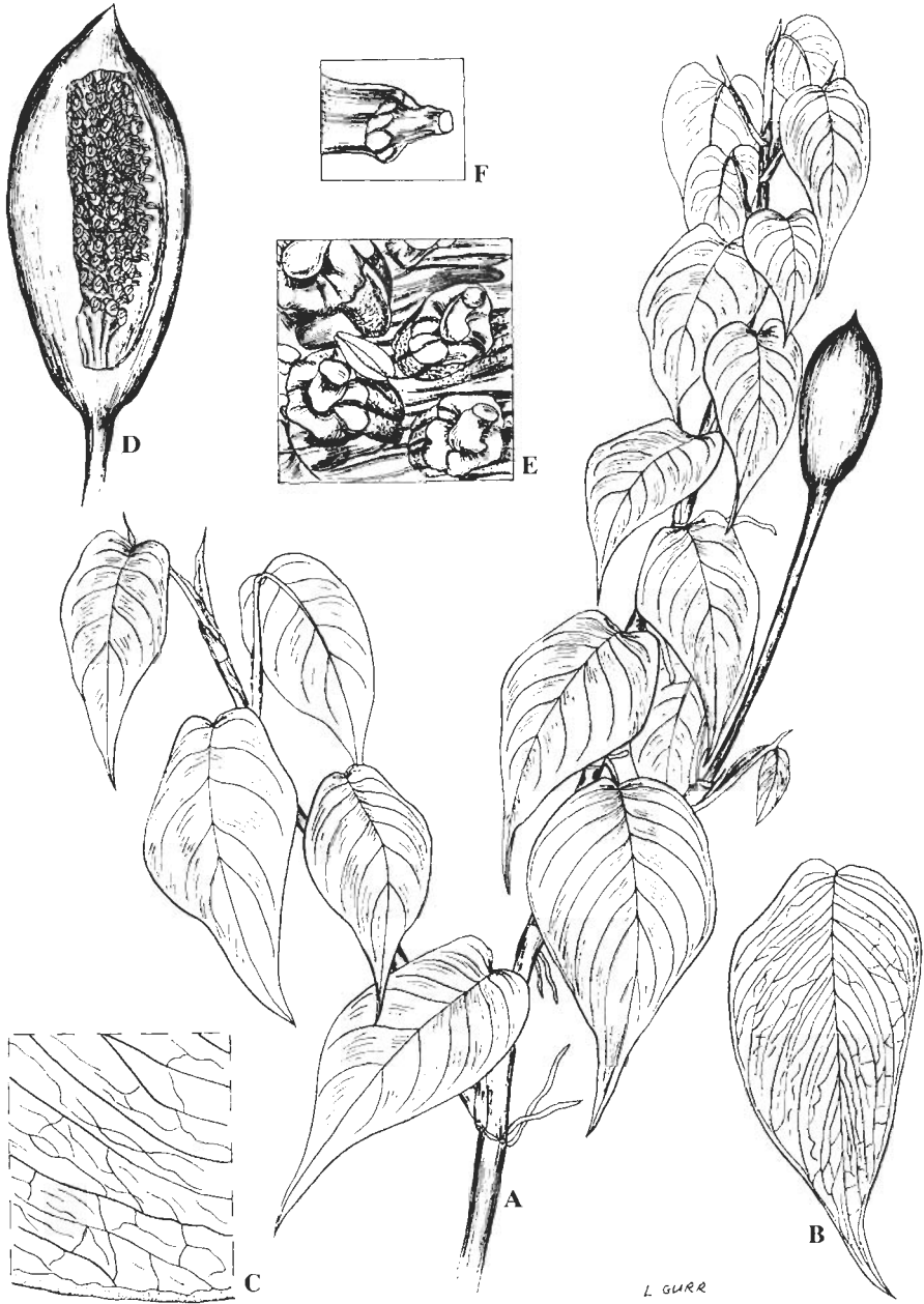
Figure 2. Rhaphidophora okapensis P.C. Boyce & Bogner A. adult shoot with flowering branch x \frac{1}{2} ; B. leaf lamina x 1; C. venation detail x 4; D. inflorescence x 1+; E. spadix detail at anthesis x 10; F. pistil, side view x 10. All from from Hartley 13098.