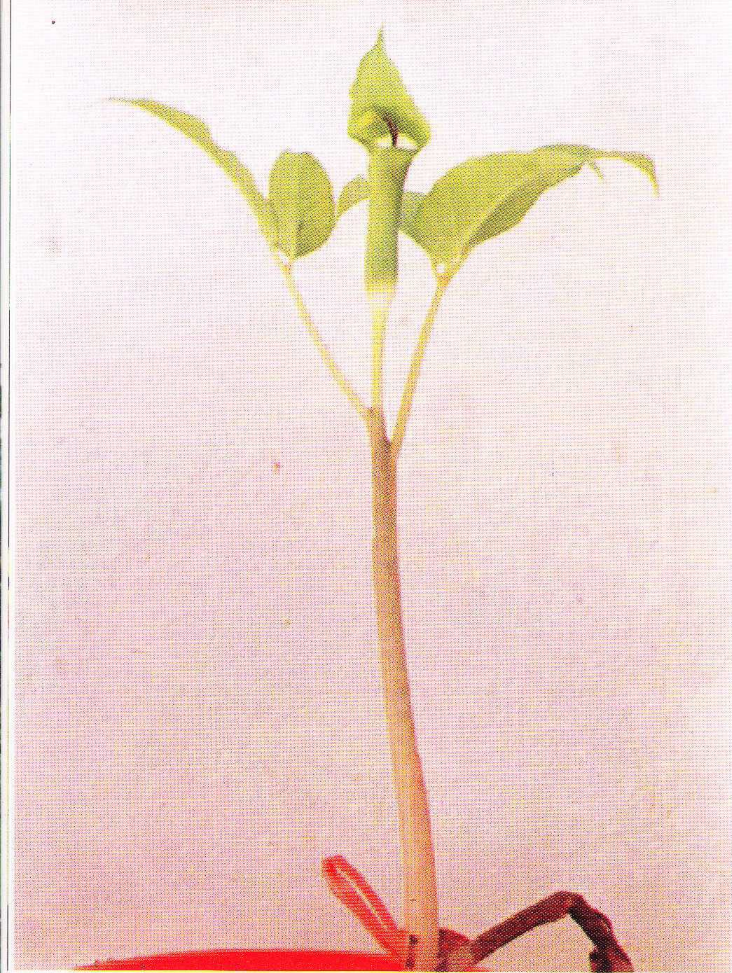
Plate 4: Arisaema rostratum V.D. Nguyen & P.C. Boyce, habit, with inflorescence.