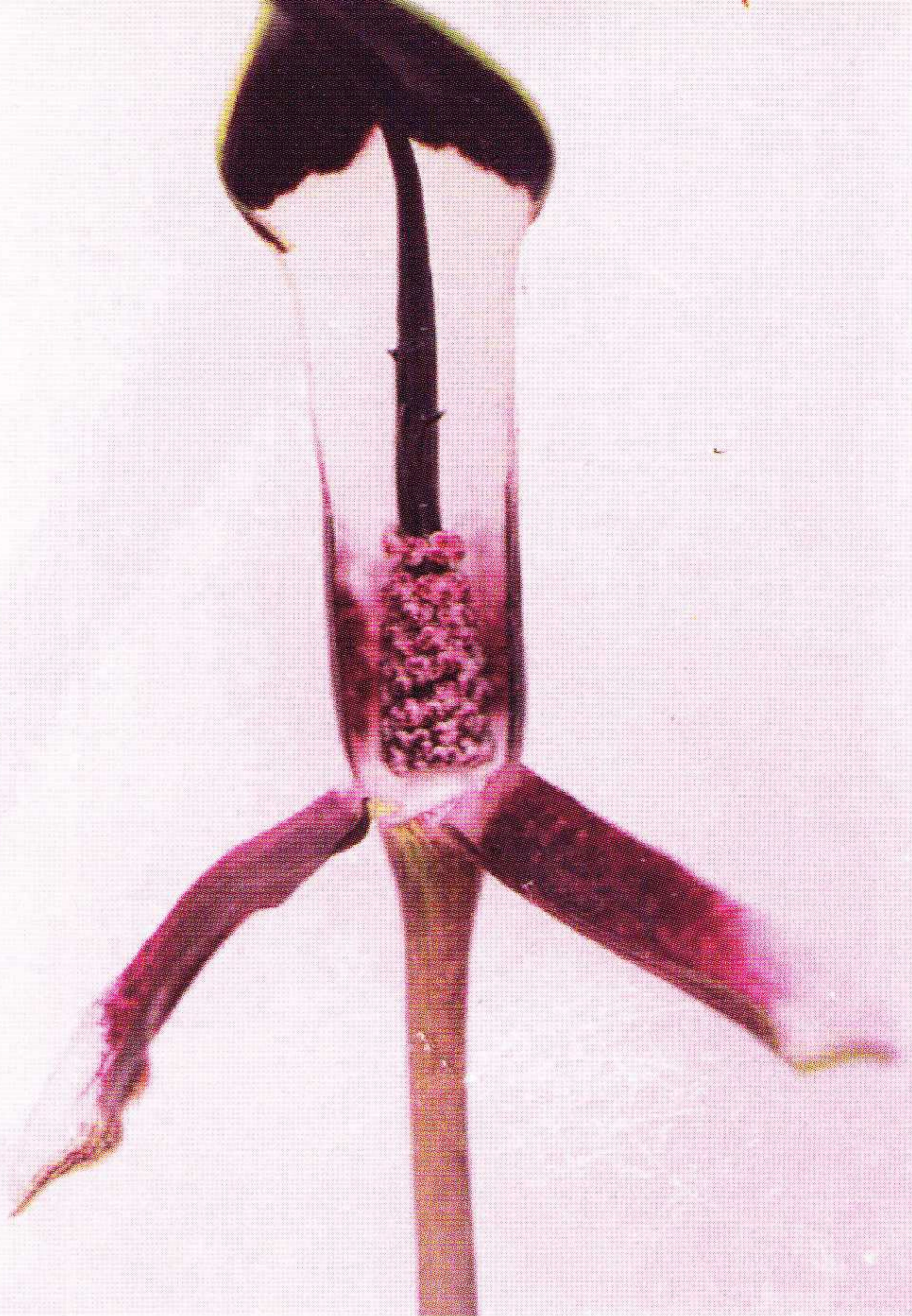
Plate 2: A. averyanovii , spadix.