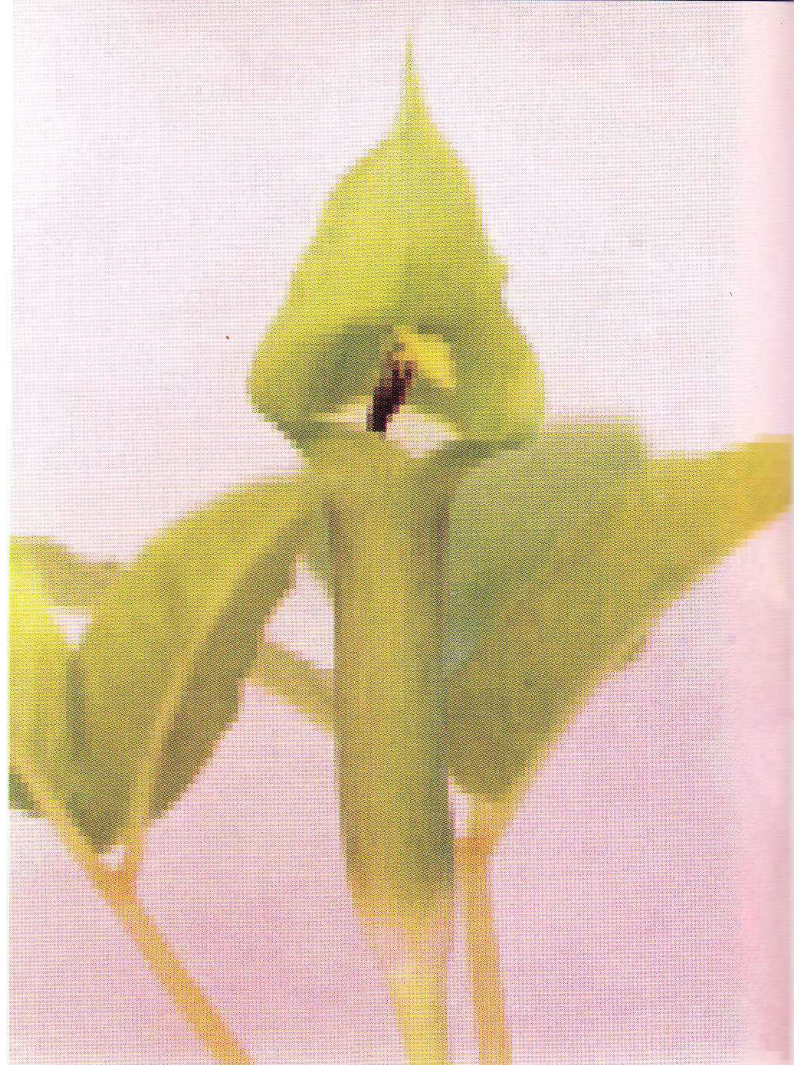
Plate 5: A. rostratum , inflorescence.