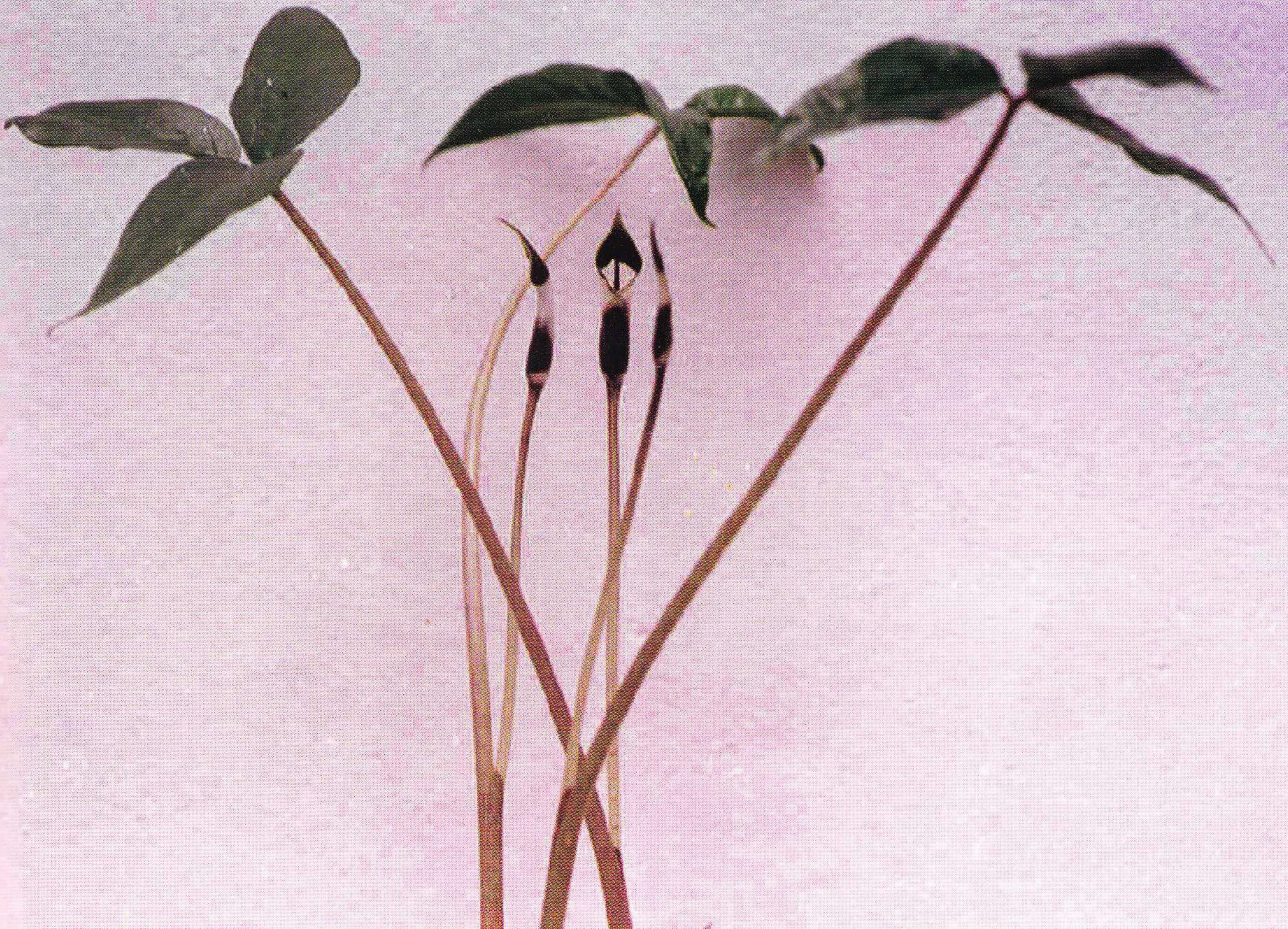
Plate 3: A. averyanovii , plant.