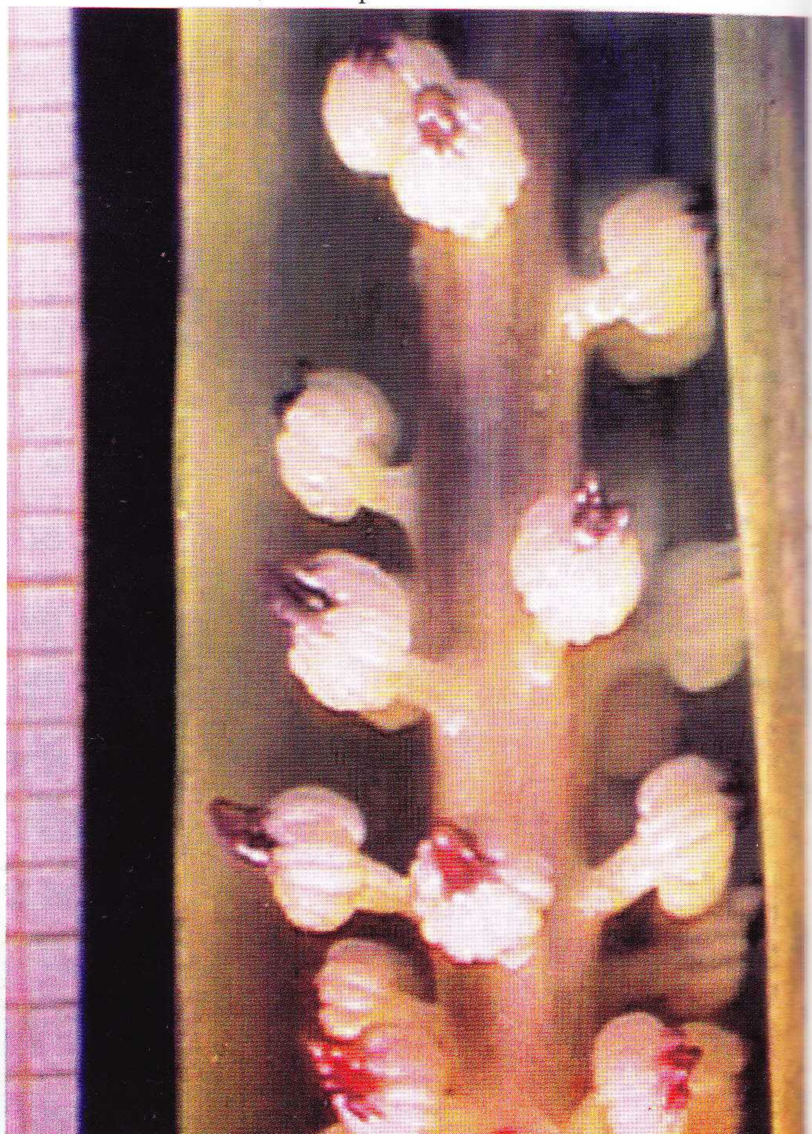
Plate 7: A. rostratum , close-up of male flowers.