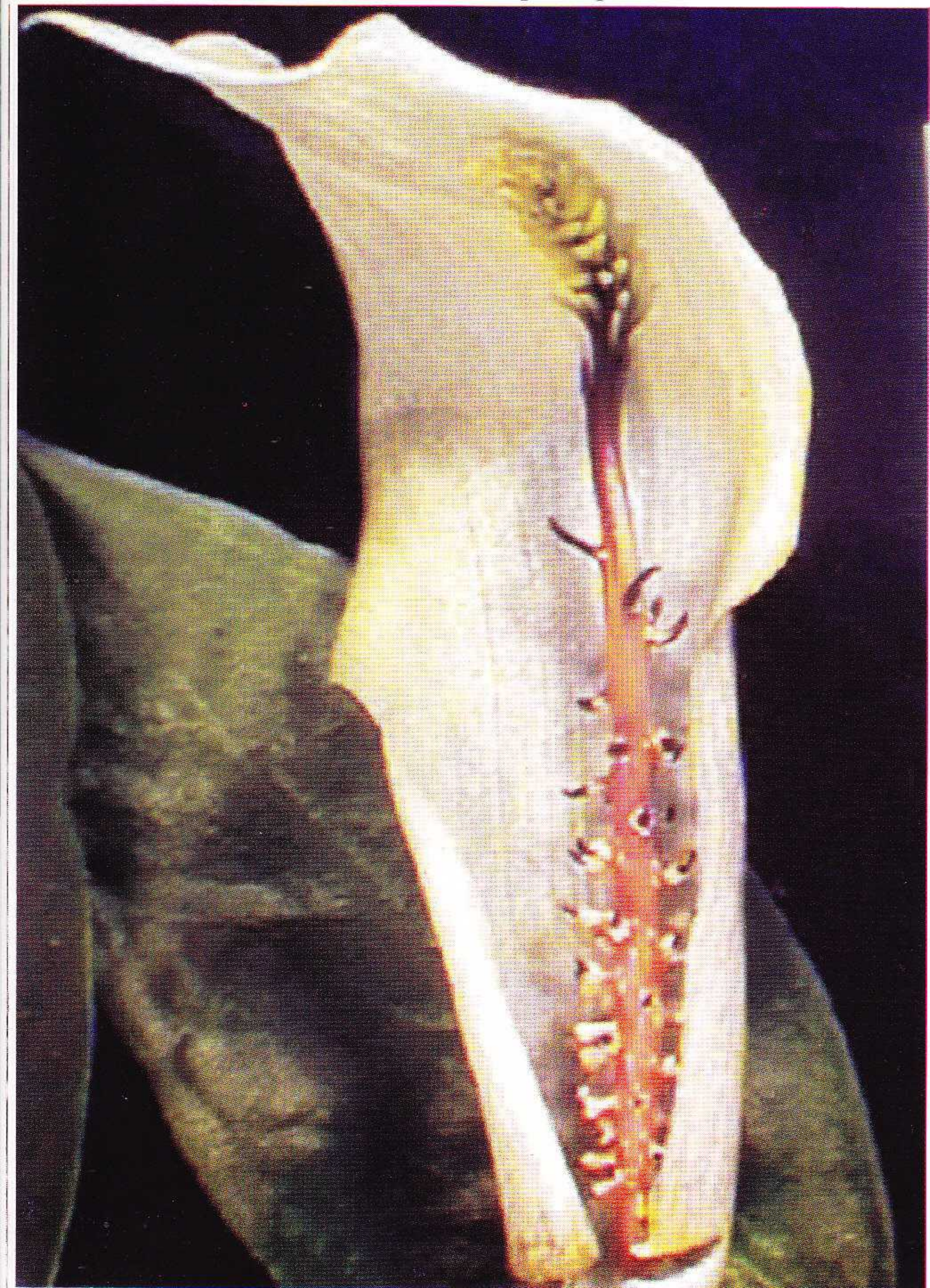
Plate 6: A. rostratum , close-up of spadix.