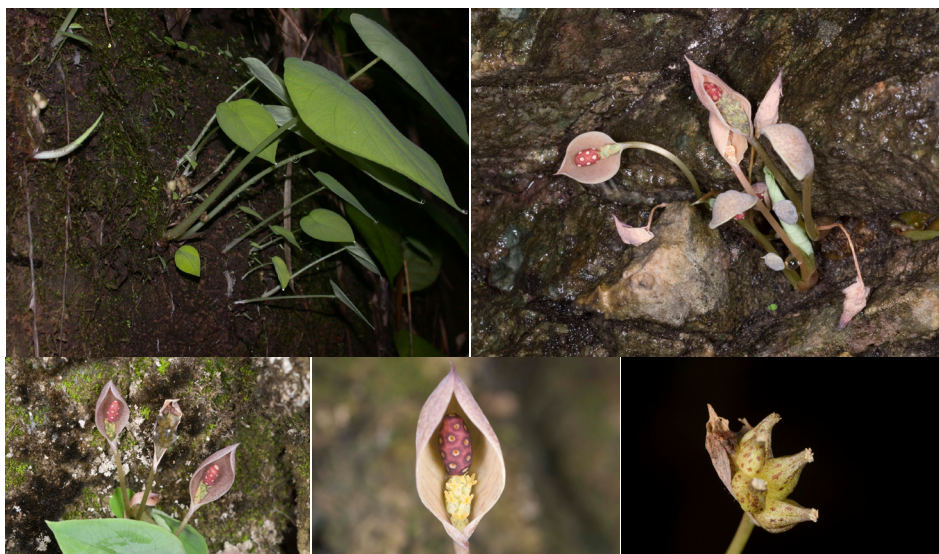
Figure 2. Ariopsis protanthera : Plants in habitat in Nong Khai.

Thailand.— NORTHERN: Tak [Thi Mo Bo Falls, Tha Song Yang, 29 May 2008, Pooma et al. , 7071A-B (BKF)]; NORTH-EASTERN: Nong Khai [Phu Wua Wildlife Sanctuary, 21 May 2004, Pooma et al. , 4203 (BKF!)].