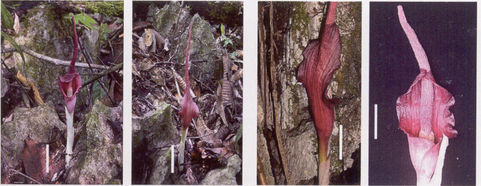
Inflorescence (scale bars — 6 cm)